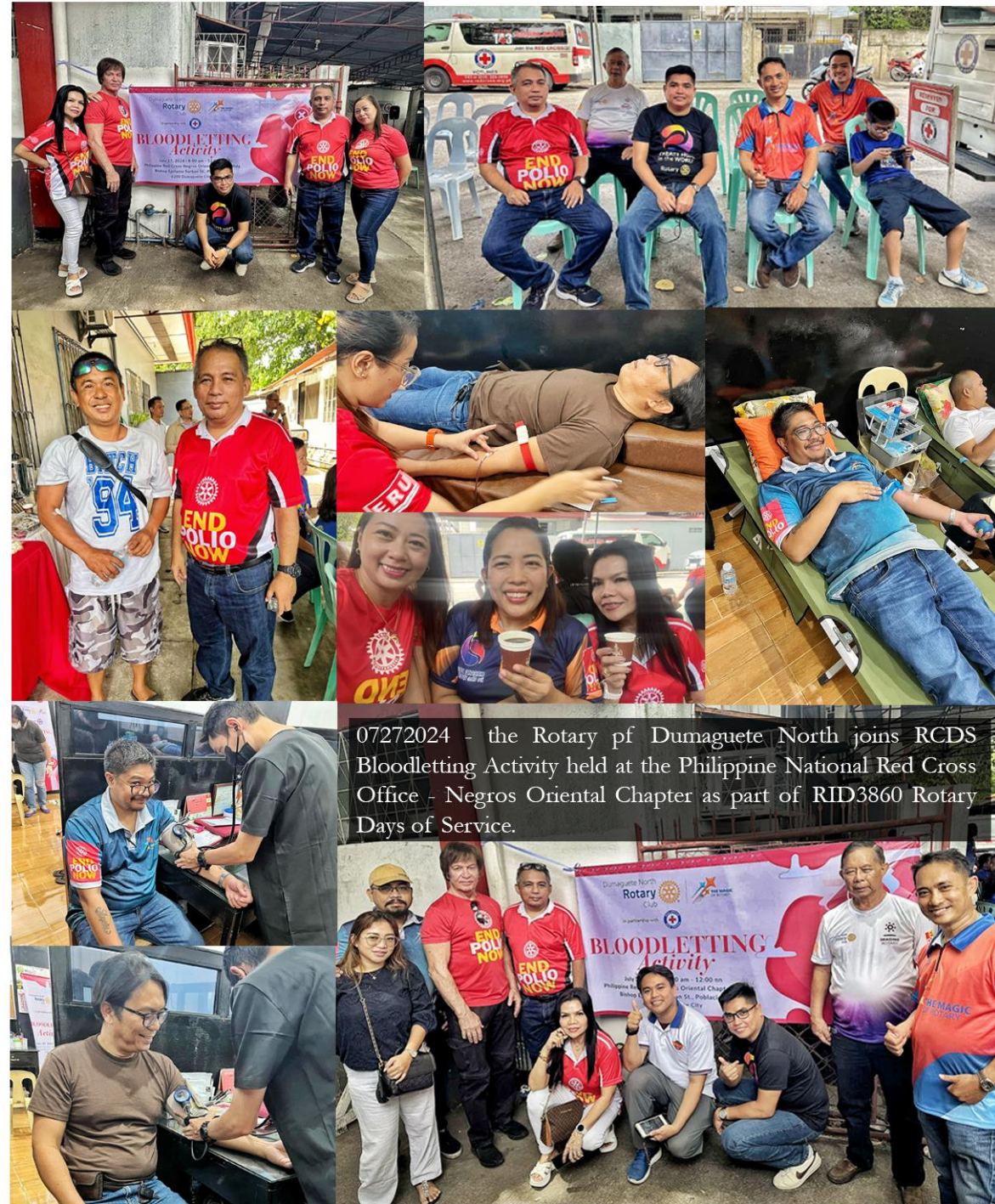
07272024 - the Rotary of Dumaguete North joins RCDS Bloodletting Activity held at the Philippine National Red Cross Office - Negros Oriental Chapter as part of RID3860 Rotary Days of Service.